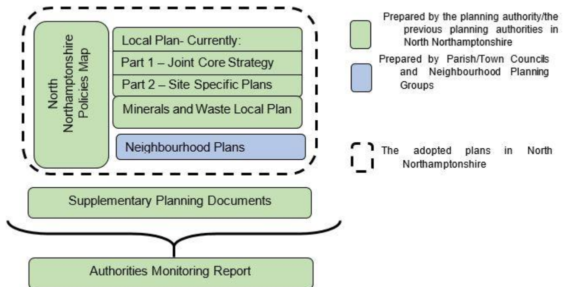
Figure 1: Plan Making in North Northamptonshire

2.3 North Northamptonshire's local plan documents are also supported by a number of Supplementary Planning Documents (SPDs) that provide detailed guidance on various planning matters which explain and amplify the policies in them. Consultation on these documents is governed by separate regulations, but will be undertaken consistent with the methods set out in this SCI.